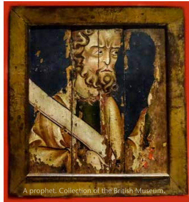
A prophet.

most of them were astonished when they heard him. They said, 'Where did the man get all this? What is this wisdom that has been granted him, and these miracles that are worked through him? This is the carpenter, surely, the son of Mary, the brother of James and Joset and Jude and Simon? His sisters, too, are they not here with us?' And they would not