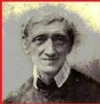
Cardinal Newman will be formally recognised as a saint by Pope Francis during the celebration of Mass in St Peter's Square, Rome on Sunday October 13 th . Come and join the Church in prayer that same evening to give thanks to God for John Henry Newman's sanctity and life of service - much of which offered in Birmingham and the Black Country - including at our church here in Boldmere.

Exposition and Evening Prayer to mark the canonisation of John Henry Newman Priest and Cardinal. October 13 th , 7.30pm St Nicholas Church, Boldmere.