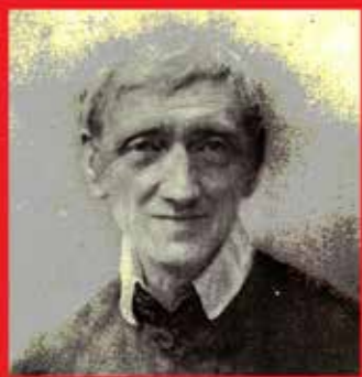
Cardinal Newman will be formally recognised as a saint by Pope Francis during the celebration of Mass in St Peter's Square, Rome on Sunday October 13th. Come and join the Church in prayer that same evening to give thanks to God for John Henry Newman's sanctity and life of service - much of which offered in Birmingham and the Black Country - including at our church here in Boldmere.

Exposition and Evening Prayer to mark the canonisation of John Henry Newman Priest and Cardinal. October 13 th , 7.30pm St Nicholas Church, Boldmere.